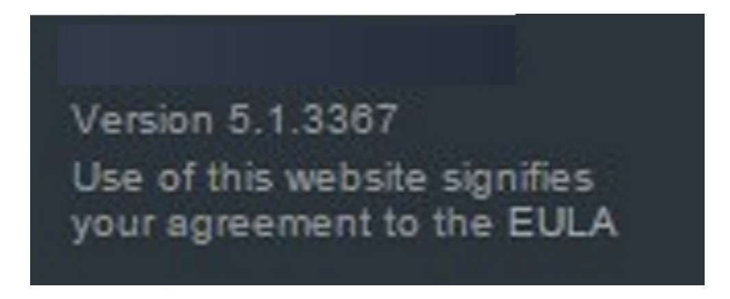
FIGURE 3 Current Cloudpath Version Lower Left

2. The Cloudpath version is displayed in the lower left corner of the Admin UI, and it is visible on all pages.